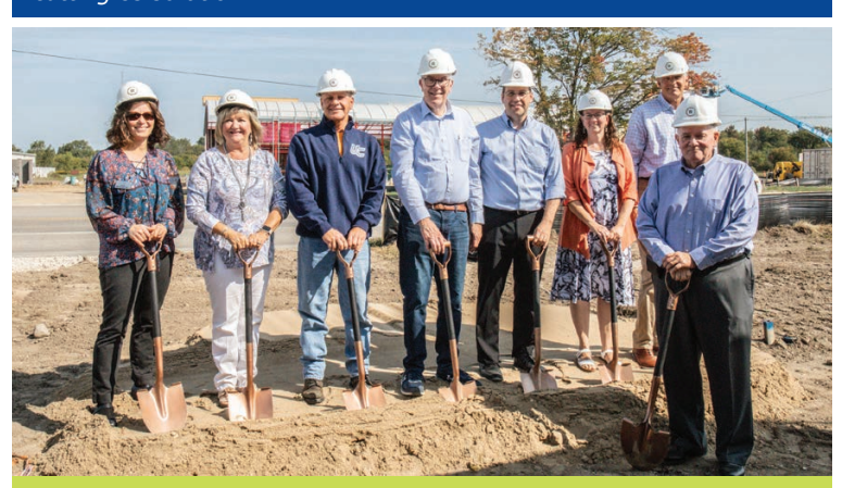
Christian Healthcare Centers broke ground on their newest primary healthcare center in Holland.