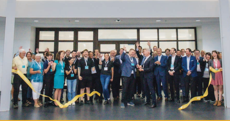
HG Medical marked the opening of their Holland location with a ribbon cutting.