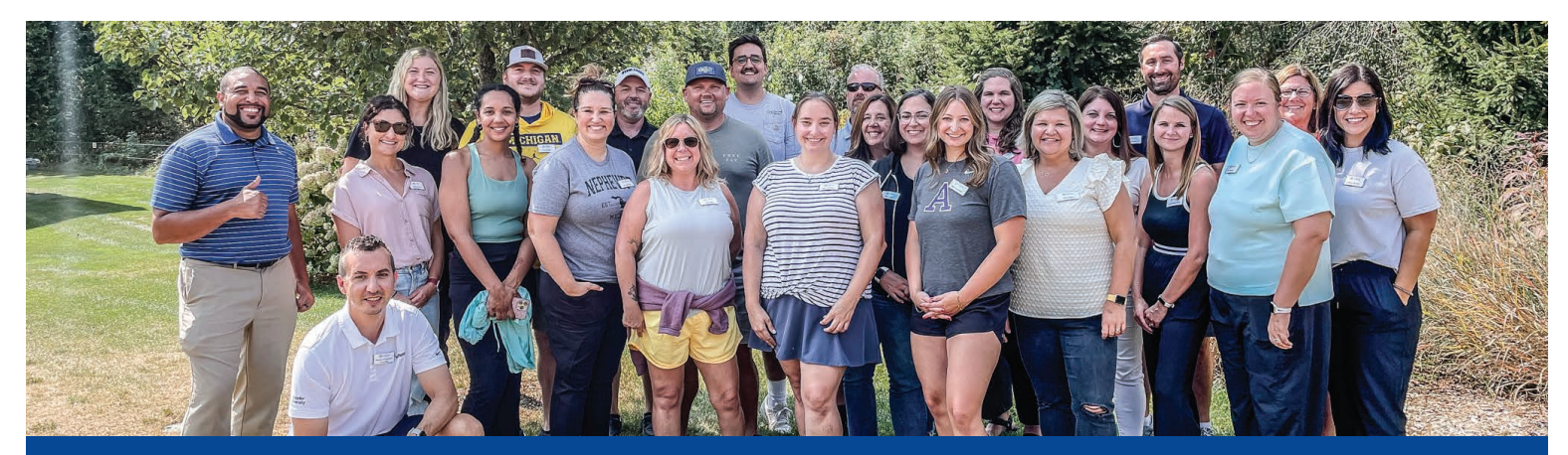
The West Coast Leadership Class of 2024-25 kicked off the year with an engaging retreat.