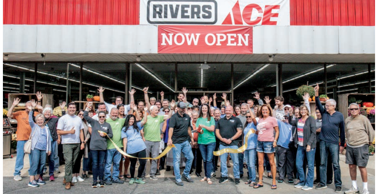
Community members gathered at Rivers Ace to celebrate the opening of their new store.